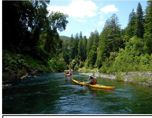
ERRP Canoe trip on Lower South Fork Eel River in June