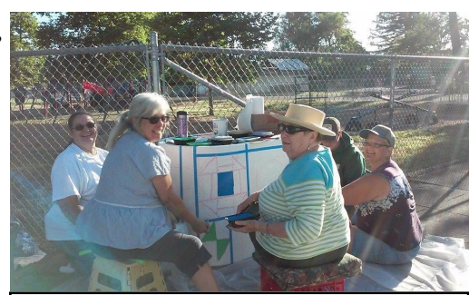
Seven volunteers with Willits Sit & Sew work on the trash bin at City Park playground.

With the return of suitable weather, WELL's Paint the Town projects have been re-energized. We organized a painting party on Sunday, June 16, at which about a dozen people picked up paint for various hydrant and trash bin projects, as well as putting a sealing coat on the flower K-rail mural. As always, volunteers love doing their creative work, and passers-by grin and thank us for beautifying our town!