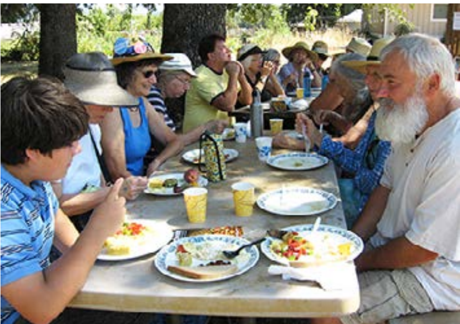
Lunch at the WISC Community Garden.