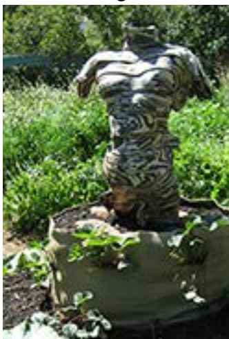
Phoenix Rising Sculpture