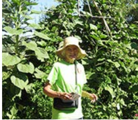
Charter Elementary School Garden

A leadership group planned the NCO-WELL co-sponsored event on Aug. 23. WELL provided food and support.