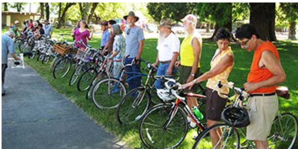
WELL's Bike Show, June 2013

Many guest speakers came to Willits from near and far, often drawing audiences of over 200. Two regional conferences were held here to stimulate localization efforts in other communities. WELL became, in part, the model for the Transition Town movement that now has spread across the world. The idea was, and still is, that localization – more self-sufficient communities – is the solution to the unsustainable globalized economy.