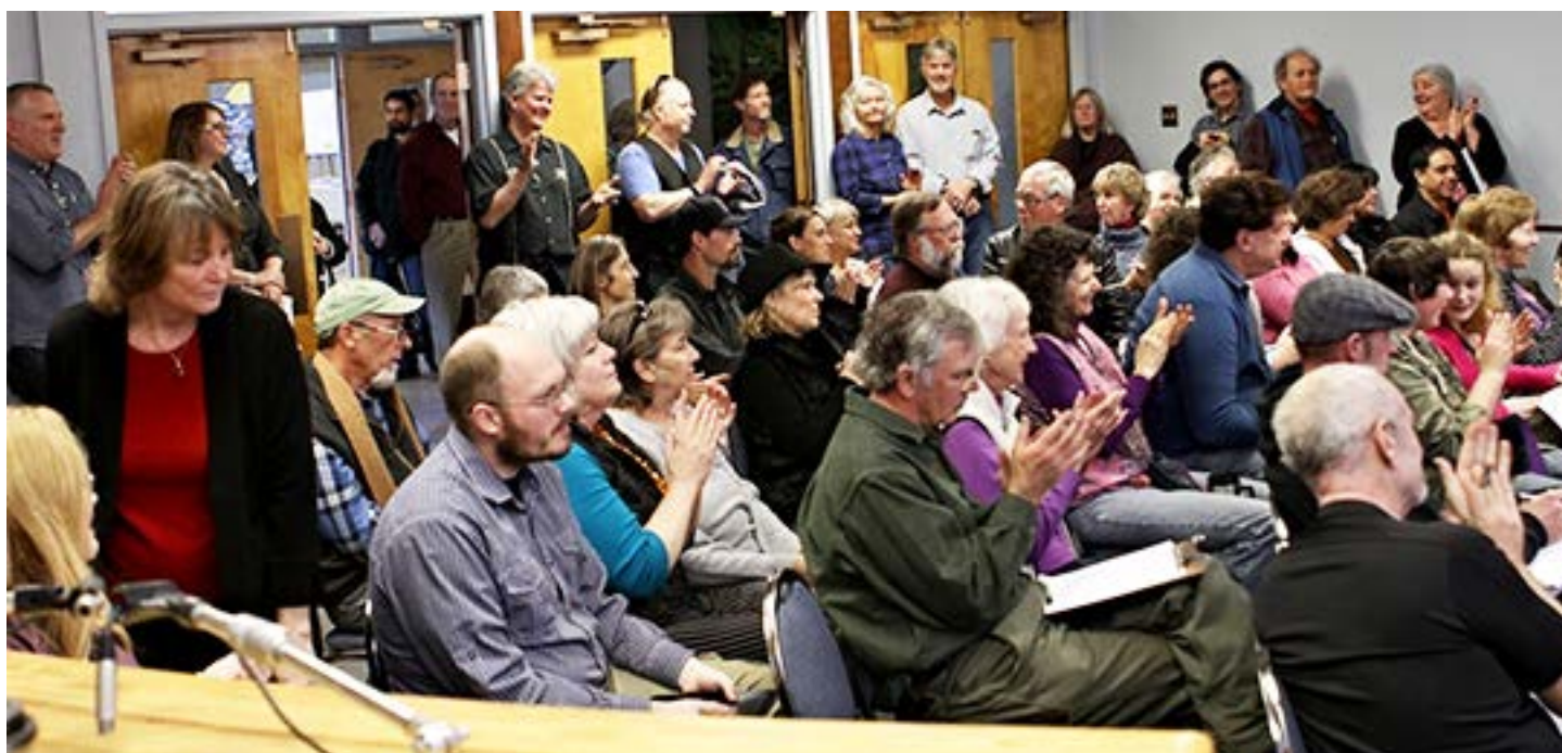
WELL's Business Fair held in November 2013

On Thursday, Oct. 16th we will definitely have a cake, and we invite the community and special guests to celebrate - where we've been and where we're headed. Come and enjoy this momentous anniversary! Lend your energy and ideas to launch the next 10 years!