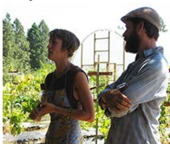
Brookside School Farm