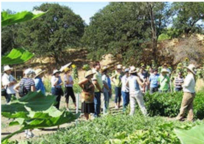
The Grange Farm School at Ridgewood Ranch

To find out more go to page 6 and see, "More on Community Gardens."