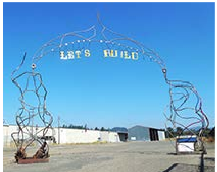
The WOWSER entry arch.

Check out our classes at www.wowserllc.com .